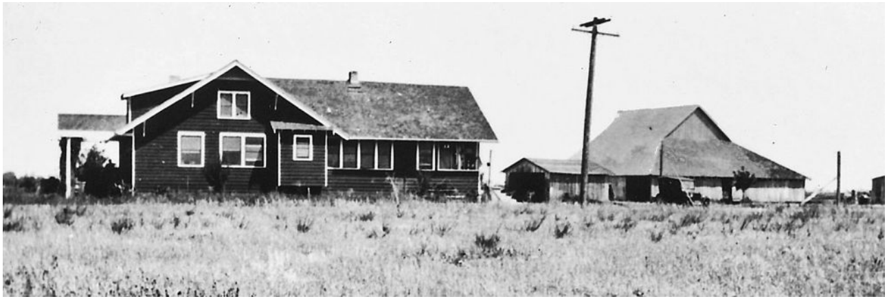
The ranch house and barn on the Scheu farm in district 10, Yuba County.